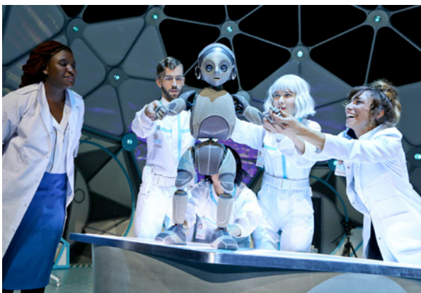
MOBY DICK vs A.H.A.B. | All Heroes Are Bastards Cooperation Retrofuturisten and Schauspiel Dortmund, 2015

„[...] A weird dream. Aesthetically, it is a feast for the eyes. And the conclusion of this evening, which is always political, remains the same: There are no simple solutions for complex things.“ (Deutschlandfunk, 30. 03.2015)