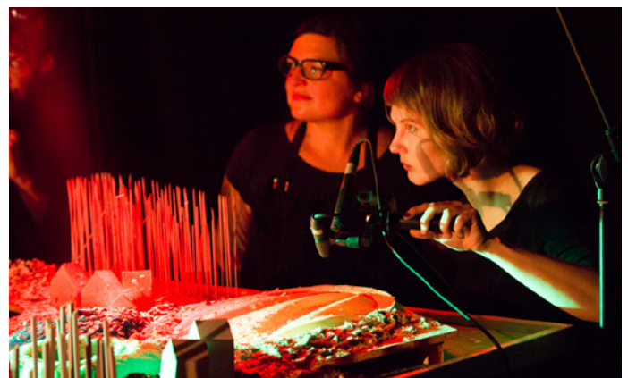
DYSTOPISCHER SALON // Schaubude Berlin, 2015-2020